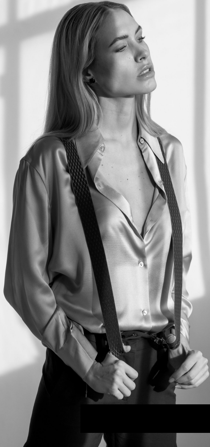
Opposite Page- GAUGES1