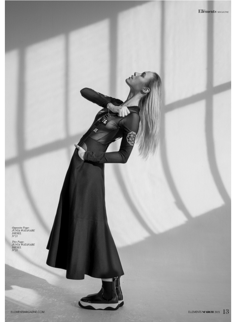
Opposite Page- JUNYA WATANABE DIESEL N°21